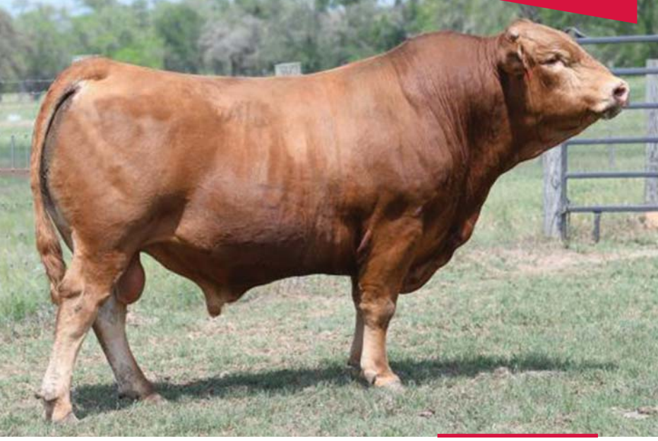
HeartBrand Smooth Criminal PH 64419