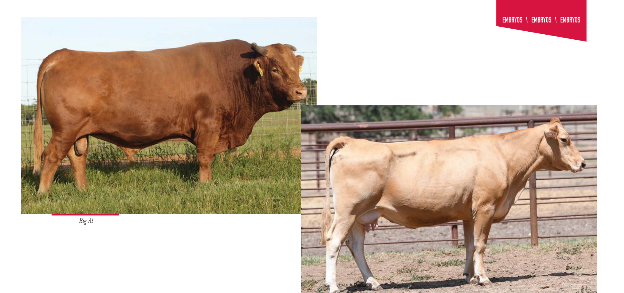
Beeman Ranch 470Z