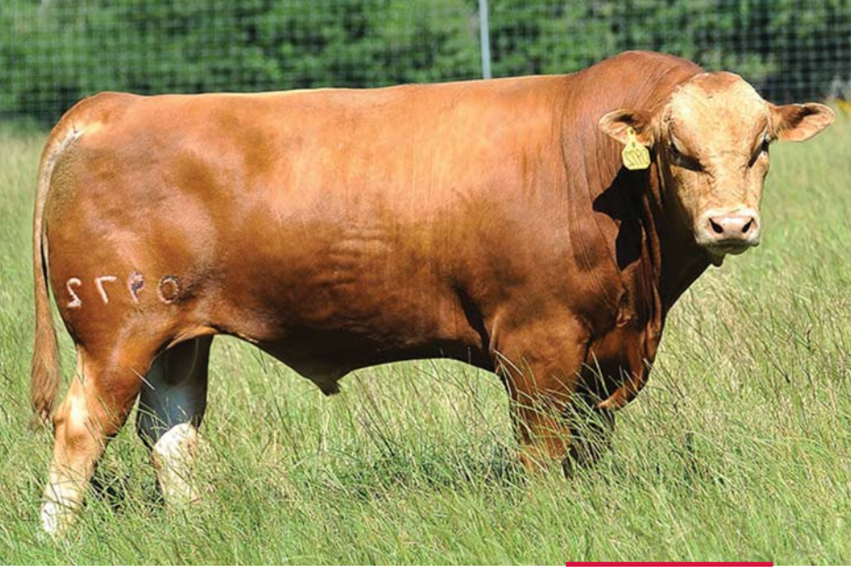
Beeman Ranch 0972B, son of Come and Take It