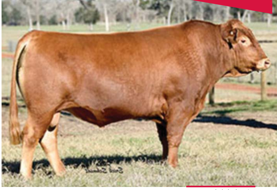
HeartBrand Rhubarb 2142A